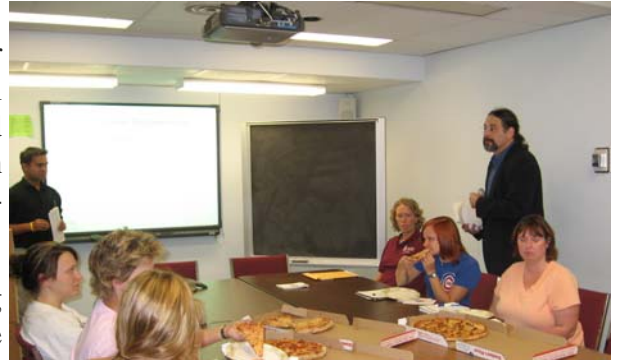
Study Abroad India Informational Meeting September 12, 2007

The approximate fee for the program is $3,900.00 not including tuition or CEUs. The cost includes airfare, in-country travel, three meals a day, double occupancy three star accommodation as well as instructional materials.